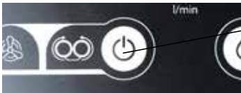
Eco / Max Power / Off mode selection button and % detergent selection