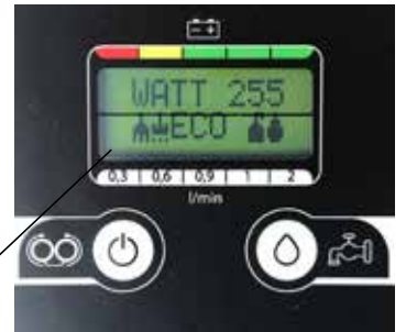
Total Power Consumption