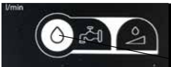
Water adjustment button from 0,3 to 2 l/min. The same button also allows draining the solution tank.