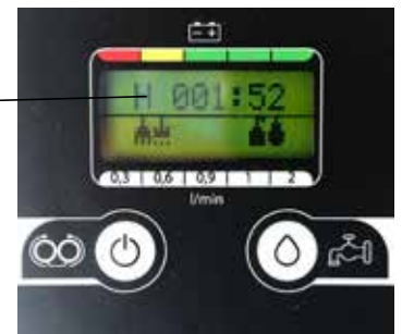
Residual runtime and hour counter