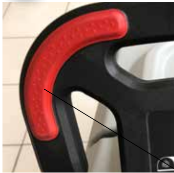
Activate washing and suction

Two simple buttons control all the functions of the scrubber dryer. One button adjusts the amount of washing solution (from 0 to 2 l/min) by displaying its value; the typical waste of manual taps is avoided. A second button simultaneously activates the washing and suction functions. A display detects the battery state, cumulative runtime (in hours). The left button allows selecting between two use modes (Eco-Max), displaying the power absorbed during operation and the residual runtime before charging is necessary. The board is already prepared for the detergent dosing system.